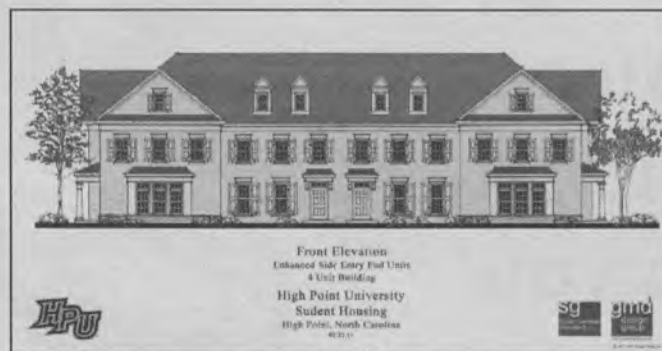
Bigger and better. Rendering of the Townhome Community to open August 2012.

As the university works to solve this problem, one thing is for certain: there is no place like home, and any room at High Point is an amazing place to call home.