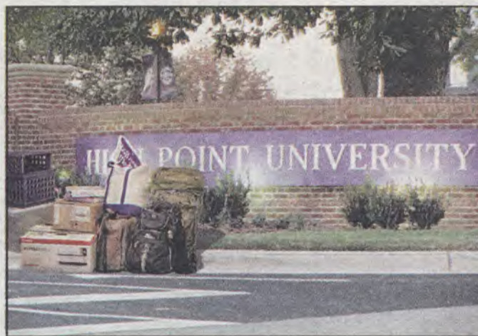
Curb appeal? Some students will be calling a local hotel "home", at least for the time being